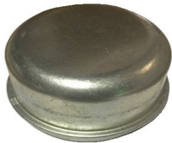
▲ 1146494 Dust/ Grease Cap