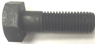
▲ 10736 - Rim Clamp Bolt- 1/2" x 13 x 1 5/8" - Coarse Thread