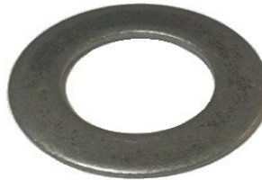
▲ 110520 Spindle Washer