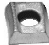
◀ 11512 - Rim Clamp "Keeper"