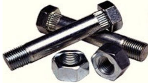
▲ 10730 - Shackle Bolt- 9/16" x 3" 10737 - Nut Only for Shackle Bolt