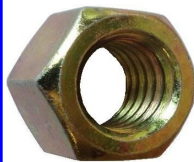
◀ 10801 - Nut Only for 10800 Hitch Bolt *3/4" Thread- Grade B (ERB) 10803 - Nut Only for 10802 Hitch Bolt *5/8" Thread- Grade B (ERB)