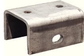
▲ Spring Hangers 11285 - 3 1/4" H x 1 3/4" W 11286 - 1 1/2" H x 1 3/4" W