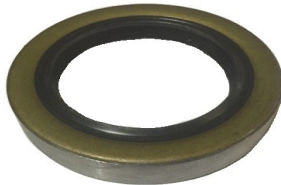
▲ 11094 Grease Seal