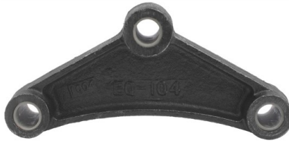
◀ 11329 - Double Eye Cast Equalizer *1.75" D.E., 9/16" holes, 5.6" overall