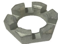
▲ 110665 Castle Nut