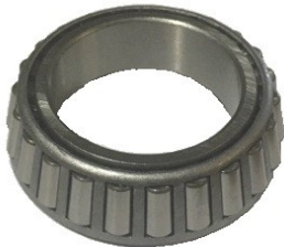
▲ Bearings 11058 - Outer Bearing 1 1/4" 11060 - Inner Bearing 1 3/8"