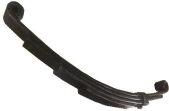
▲ 13072 - Double Eye, Four Leaf Spring- 25 1/4" Long x 1 3/4" Wide 3000# capacity