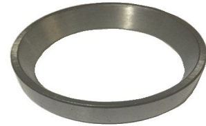
▲ Race/ Bearing Cups 11057 - Cup for Outer Bearing -1 1/4" 11061 - Cup for Inner Bearing- 1 3/8"