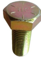
▲ 10800 - Hitch Bolt *3/4" Thread x 2" length- Grade B (ERB)- Use with 10801 nut. 10802 - Hitch Bolt *5/8" Thread x 2" length. Use with 10803 nut- Grade B (ERB)