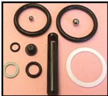
◀ 10220- 20 Ton Repair Kit

*For newer Norco Hydraulic Jacks only. Includes seals, filter plug, O-rings, and chrome check balls.