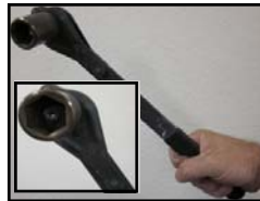
◀ 10009 - Anchor Speed Wrench

*Simplifies anchor installation- allows for one-handed operation- for installing frame ties and tension head bolts- 15/16" socket on one side and a 15/16" nut on the other- for use with ratchet combined with 15/16" socket.