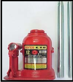
▲ 10112- Norco 12 Ton/ Low- (Height 6 11/16" to 13 3/16")