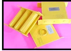
◀ 10500 Complete 3-point 3 Roller Set (Loads up to 27,000#)

*Complete roller systems include two flattop sections, specify 3 or 5 rollers, and one ring top for hitch jack. Track not provided. (We recommend heavy gauge channel iron or aluminum for track.) Rollers are 2" x 5/16" machined seamless tubing with press fitted bearings. No need to grease or oil...ever! Flanges are 3/4" steel- Top plates are 1/2" steel.