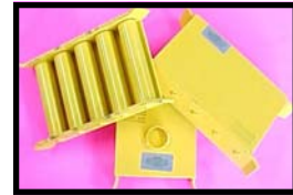
10501 Complete 3-point 5 Roller Set (Loads up to 50,000#)