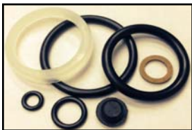
◀ 10212-NEW- 12 Ton Repair Kit

*For newer Norco Hydraulic Jacks only. Includes seals, filter plug, O-rings, and chrome check balls.