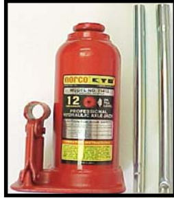
▲ 10113- Norco 12 Ton/ Standard- (Height 9 7/16" to 18 7/8")