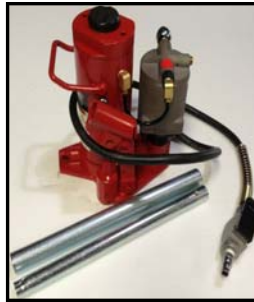
▲ 10113-A/H 12 Ton Air/ Hydraulic Jack (Height 9.625" to 19.75") *One year warranty- reduces lifting time- push button air valve- longer wear life- highly portable- versatile in mobile home set-up operations.