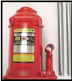
▲ 10121- Norco 20 Ton/ Standard- (Height 10 13/16" to 20 3/16")