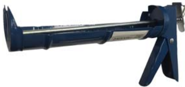
▲ 41150 - Caulking Gun *Holds 11 oz. Cartridges.