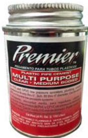
◀ 30792 1/4 Pint All-Purpose Cement *For ABS, PVC, CPVC, and styrene, all classes and schedules through 6" diameter. Fast setting.