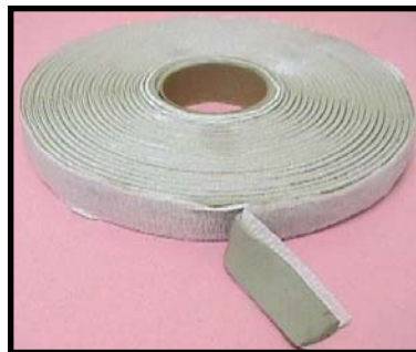
◀ 85000 Putty Tape- 30' Length- 1/8" Thick x 3/4" Wide

*Excellent, easy-to-use sealant product for doors and windows, but the butyl is better!