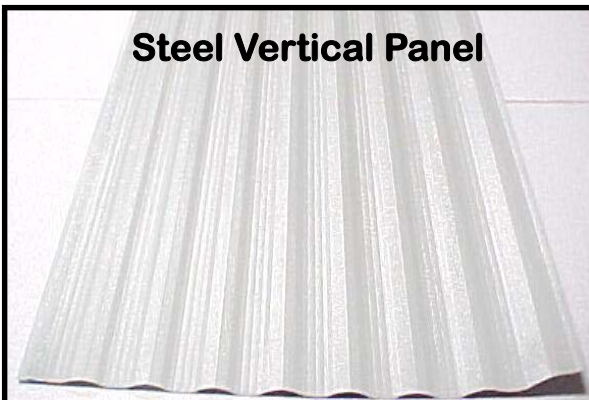
Steel Vertical Panel

Full panels measures 32 1/2" x 96". Cut to smaller pieces. 48078- White 48048- Light Stone