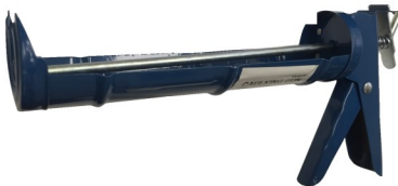
▲ 41150 - Caulking Gun *Holds 11 oz. Cartridges.