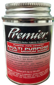
◀ 30792 1/4 Pint All-Purpose Cement *For ABS, PVC, CPVC, and styrene, all classes and schedules through 6" diameter. Fast setting.