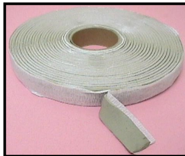
◀ 85000 Putty Tape- 30' Length- 1/8" Thick x 3/4" Wide *Excellent, easy-to-use sealant product for doors and windows, but the butyl is better!