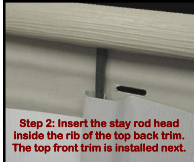
Step 2: Insert the stay rod head inside the rib of the top back trim. The top front trim is installed next.