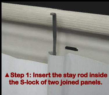
▲ Step 1: Insert the stay rod inside the S-lock of two joined panels.