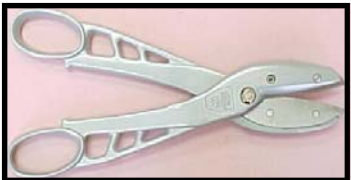
▲ 70295- M14 Tin Snips *Larger snips with more leverage, the preferred snips for all types of skirting. 14" length.

*For use with vinyl skirting. Allows panel to expand and contract with seasonal changes. Using 1 rod for every 3-4 panels is recommended. Use more frequently for taller panels or windy areas, or upgrade to 24" rods. 70000- 12" Length *For panels up to 36" tall 70001- 24" Length *For panels 36" and taller