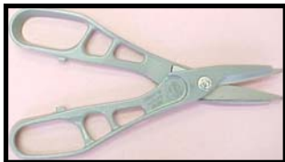
▲ 70294- M12 Tin Snips *For cutting panels and trim. Easy to use and durable. 12" length.