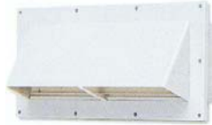
▲ 69536 Exterior Exhaust Cover with Damper- White Plastic *Fits opening of 3 1/2" x 10 1/2"