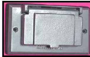
◀ 50056 Aluminum Cover Plate for GFCI Receptacle- with water-proof rubber backing.