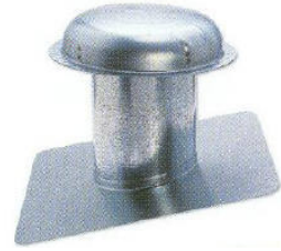
▲ Roof Vent Cap with Sloped Roof- Galvanized Steel 9 3/4" Down inside roof 30081- 5" Width 30083- 7" Width