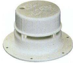
▲ 38015- Plumbing Roof Vent Cap- White Plastic *For 1 1/2" ID pipe.