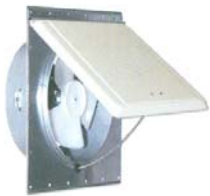
▲ 69545 Sidewall Exhaust Fan - White Exterior *3"- 4" Wall