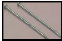
◀ 69547 Screws for Grill Cover *Sold singularly