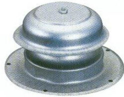
▲ 38016- Plumbing Roof Vent Cap- Galvanized Metal *For 1 1/4" or 2 1/2" pipe.