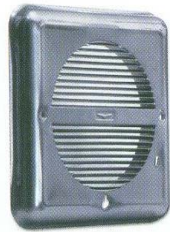
◀ Grill Covers for Sidewall Exhaust Fans *Screws not included. 69546- Chrome 69546-W- White