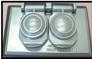
◀ 50055- Duplex Receptacle Cover- Aluminum- with water-proof rubber backing.