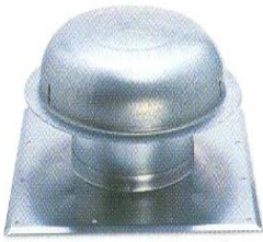
▲ Roof Vent Cap- Galvanized Steel- *4 3/4" above roof line. 30080- 5" Diameter 30082- 7" Diameter