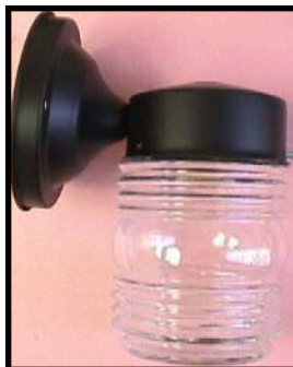
▲ 50067- Globe and Base Complete- Clear Glass- *Black Metal Base. Comes with mounting bracket and screws.