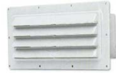
▲ 69535 Exterior Exhaust Cover- White Plastic *Fits opening of 3 1/2" x 10 1/2"