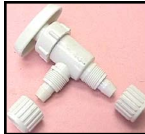
◀ 02885 Angle Stop Valve (90°) 1/2" x 1/2"

02840 - 1/2" x 1/2" 02845 - 1/2" x 3/4" 02846 - 3/4" x 3/4" 02853 - 1/2" x 3/8" 02855 - 3/8" x 3/8"