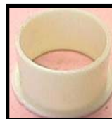
◀ 06792 Polybutylene to Pex Adapter / Bushing

*Required when connecting any Flair-It fitting to 3/4" Polybutylene