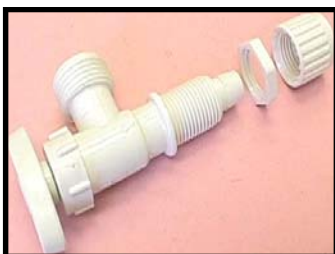
▲ 02887 - Hose Bibb Washing Machine Valve- 1/2" PEX *Flairs to Polybutylene or PEX tubing.

*Required when connecting any Flair-It fitting to 3/4" Polybutylene