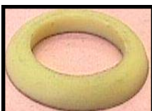
◀ Saniprene Swivel Seal 02435 - 1/2" 02465 - 3/4"