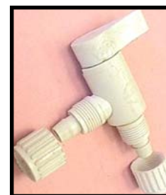
◀ Angled Drain Valve 02882 - 3/8" x 3/8"