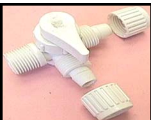
▲ 02912 - Three-Way Stop Valve- 1/2" x 1/2" MPT x 1/2"