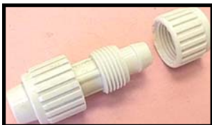
▲ Plug (used to plug into ends of tubing) 02862 - 3/8" Plug 02863 - 1/2" Plug 02864 - 3/4" Plug