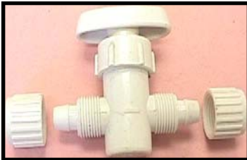
▲ Straight (In-Line) Stop Valve