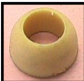
◀ 02482 Saniprene Ball-cock Seal