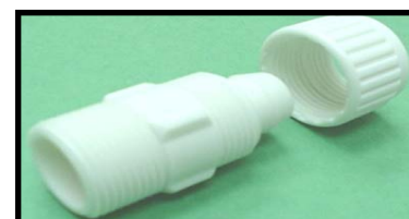
▲ 02872 3/4" MPT x Water Heater Connection