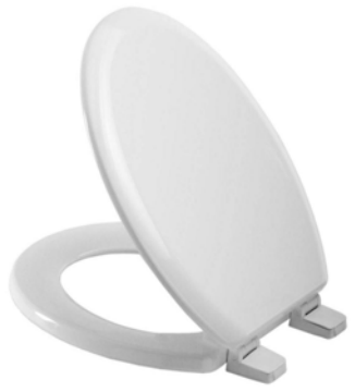
▲ Plastic Toilet Seats 30066-W- White