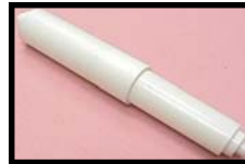
▲ 30076 Replacement Roller for Tissue Holder (Plastic, spring-loaded)