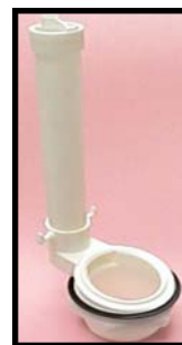
▲ 30065 Plastic Flush Valve *Replacement rubber flapper not included.