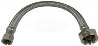
▲ 22313-COMP - 12" Toilet Riser Connection- *3/8" Compression x 7/8" Ball Cock- Stainless Steel