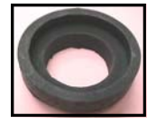
▲ 30073- Tank to Bowl Rubber Gasket