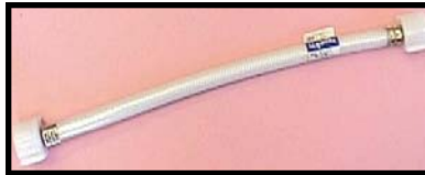
▲ 22313 - 12" Toilet Riser Connection- *1/2" Female Pipe Thread x Ball Cock Thread.