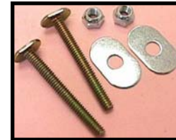
▲ 30060 - Closet Bolt for Floor Flange *Sold by the pair (as pictured).