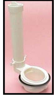
▲ 30065 Plastic Flush Valve *Replacement rubber flapper not included.