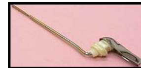
▲ 30070 Metal Tank Flush Lever