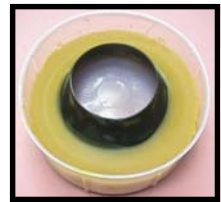
▲ 30064- Wax Ring with Flange