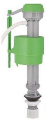
◀ 30062-F- Anti Siphon Fill Valve