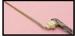
▲ 30070 Metal Tank Flush Lever