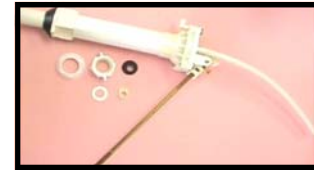
▲ 30062 - Standard Ball Cock Assembly