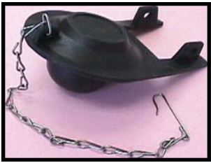
▲ 30061- Universal Replacement Rubber Flapper and Chain