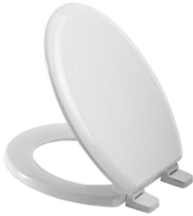
▲ 30066-W - White Plastic Toilet Seat