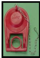
◀ 30061-KR - "Korky Red" Replacement Rubber Flush Valve Flapper