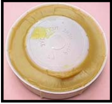
▲ 30063- Wax Ring with no Flange