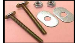
▲ 30060- Closet Bolt for Floor Flange *Sold by the pair (as pictured). Heavy-duty. Includes nut and washer.