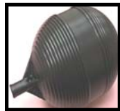
▲ 30071 Plastic Float Ball