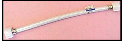
▲ 22313- 12" Toilet Riser Connection- *1/2" Female Pipe Thread x Ball Cock Thread.