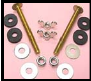
◀ 30072 Tank to Bowl Bolts (Sold by the Pair)