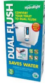
▲ 30056 - "HydroRight" Dual Flush Converter *Replaces Tank Flush Lever and Flapper while saving water.