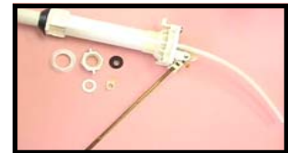
▲ 30062- Standard Ball Cock Assembly