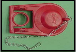
▲ 30061-KR- "Korky Red" Replacement Rubber Flush Valve Flapper