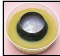
▲ 30064 - Wax Ring with Flange