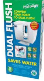
▲ 30056- "HydroRight" Dual Flush Converter *Replaces Tank Flush Lever and Flapper while saving water.