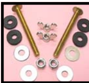
◀ 30072 Tank to Bowl Bolts (Sold by the Pair)