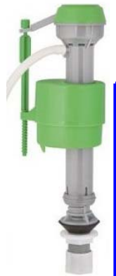
◀ 30062-F - Anti Siphon Fill Valve