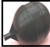
▲ 30071 Plastic Float Ball