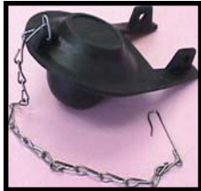
▲ 30061 - Universal Replacement Rubber Flapper and Chain