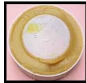
◀ 30063 - Wax Ring with no Flange