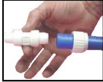
▲ Step 1 - Slide nut over tubing.