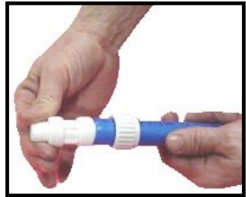
▲ Step 2- Insert fitting into tubing until it rests against the fitting threads.