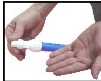
▲ Step 3- Slide nut on to the threads and tighten securely.