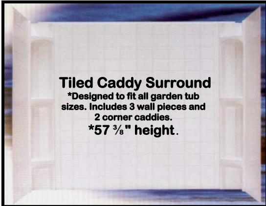
Tiled Caddy Surround *Designed to fit all garden tub sizes. Includes 3 wall pieces and 2 corner caddies. *57 7/8" height.