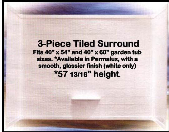
3-Piece Tiled Surround Fits 40" x 54" and 40" x 60" garden tub sizes. *Available in Permalux, with a smooth, glossier finish (white only) *57 13/16" height.