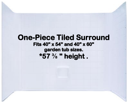
One-Piece Tiled Surround Fits 40" x 54" and 40" x 60" garden tub sizes. *57 3/8" height.