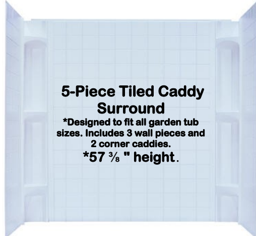
5-Piece Tiled Caddy Surround *Designed to fit all garden tub sizes. Includes 3 wall pieces and 2 corner caddies. *57 3/8" height.