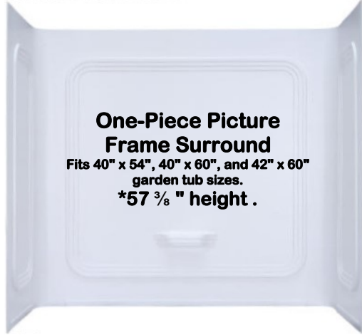
One-Piece Picture Frame Surround Fits 40" x 54", 40" x 60", and 42" x 60" garden tub sizes. *57 3/8" height.