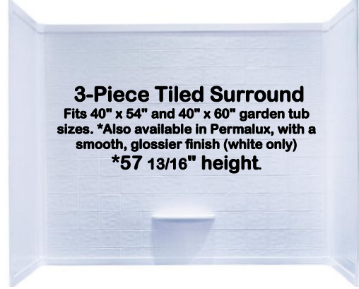
3-Piece Tiled Surround Fits 40" x 54" and 40" x 60" garden tub sizes. *Also available in Permalux, with a smooth, glossier finish (white only) *57 13/16" height.