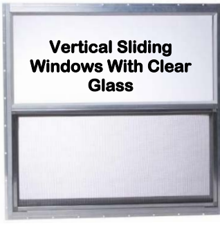
Vertical Sliding Windows With Clear Glass