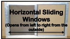
Horizontal Sliding Windows (Opens from left to right from the outside)

*Normally used for bathrooms and other private places.