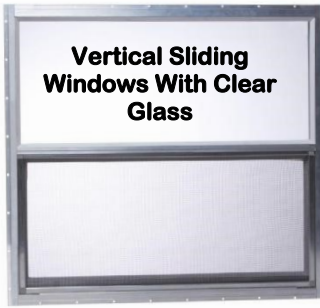
Vertical Sliding Windows With Clear Glass

Standard Features: *Aluminum Frame *Inset depth 1 7/16" *1/2 Screen *1" Wide Exterior Flange Window Options: *Grid Patterns *Additional Lap Flange *Obscure Glass (Window options not available for 14 x 20 sizes)