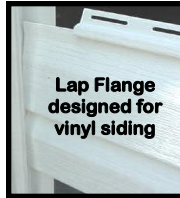
Lap Flange designed for vinyl siding