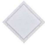
◀ 10" x 10" Square or Diamond Window- White Frame- Clear or Obscure Glass

*Left-Hand Hinged (Hinges on left looking from outside) *Smooth White Fiberglass Exterior or Interior (choices: White only) *Painted White Door Frame *Aluminum Exterior Skin (Red, Black, or Silver) *Flexible Screw Cover for Outside Frame (White or Black) *Other Inside Door Colors- Off-White, Light Tan or Medium Brown (pebbled finish only) *Other Outside Door Colors- Off-White, Light Tan, or Medium Brown (pebbled finish only) *Without Screen Door *7" Kick-Panel on Inside Screen Door (Black Aluminum or White Fiberglass) *Painted White Finish Screen Door *1 or 2 Crossbars on screen door in Mill or White