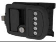
◀ Bauer NE Keyless Entry System Installed