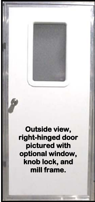
Outside view, right-hinged door pictured with optional window, knob lock, and mill frame.

Shipping Note: *RV Doors must ship by freight unless located within local delivery route area. Please contact us for an exact shipping and handling quote.