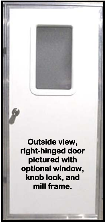
Outside view, right-hinged door pictured with optional window, knob lock, and mill frame.