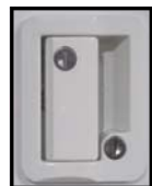
◀ Flush-Mount Non-Safety Lock with Integral Keyed Deadbolt Installed- 2 keys (White or Black Finish - white pictured)

Additional Options: *Left-Hand Hinged (Hinges on left looking from outside) *Smooth White Fiberglass Exterior or Interior (choices: White only) *Painted White Door Frame *Aluminum Exterior Skin (Red, Black, or Silver) *Flexible Screw Cover for Outside Frame (White or Black) *Other Inside Door Colors- Off-White, Light Tan or Medium Brown (pebbled finish only) *Other Outside Door Colors- Off-White, Light Tan, or Medium Brown (pebbled finish only) *Without Screen Door *Full or 7" Kick-Panel on Inside Screen Door (Black Aluminum or White Fiberglass) *Painted White Finish Screen Door *1 or 2 Crossbars on screen door in Mill or White