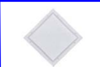
▲ 10" x 10" Square or Diamond Window- White Frame- Clear or Obscure Glass