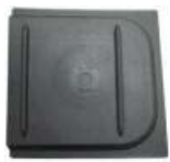
Black Molded Slide-Bubble on Inside Screen Door ▶