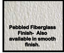
Pebbled Fiberglass Finish- Also available in smooth finish.