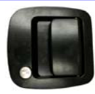
◀ Flush-Mount Safety Lock Installed (Black Only)

Additional Options: *Left-Hand Hinged (Hinges on left looking from outside) *Smooth White Fiberglass Exterior or Interior (choices: White only) *Painted White Door Frame *Aluminum Exterior Skin (Red, Black, or Silver) *Flexible Screw Cover for Outside Frame (White or Black) *Other Inside Door Colors- Off-White, Light Tan or Medium Brown (pebbled finish only) *Other Outside Door Colors- Off-White, Light Tan, or Medium Brown (pebbled finish only) *Without Screen Door *Full or 7" Kick-Panel on Inside Screen Door (Black Aluminum or White Fiberglass) *Painted White Finish Screen Door *1 or 2 Crossbars on screen door in Mill or White