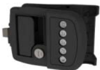
◀ Bauer NE Keyless Entry System Installed