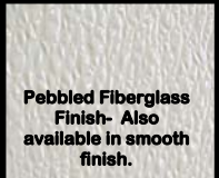
Pebbled Fiberglass Finish- Also available in smooth finish.