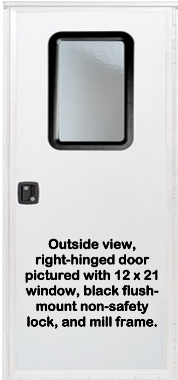
Outside view, right-hinged door pictured with 12 x 21 window, black flush-mount non-safety lock, and mill frame.