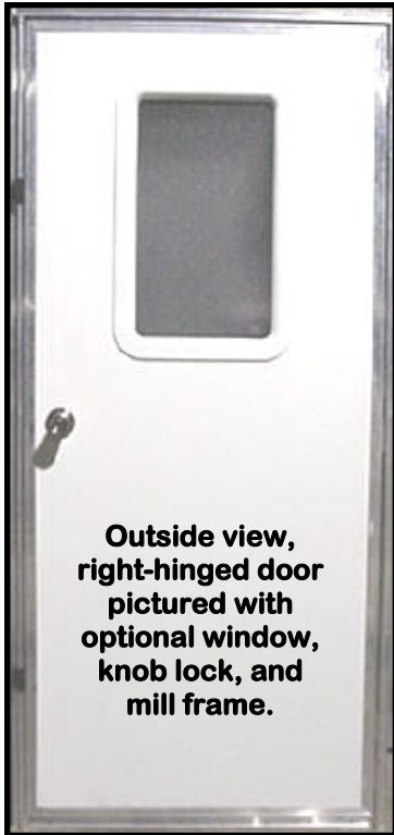
Outside view, right-hinged door pictured with optional window, knob lock, and mill frame.

Shipping Note: *RV Doors must ship by freight. Please contact us by phone or email for an exact shipping and handling quote. Allow 4-5 weeks for shipping.