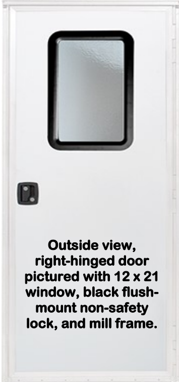
Outside view, right-hinged door pictured with 12 x 21 window, black flush-mount non-safety lock, and mill frame.