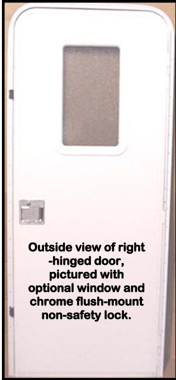
Outside view of right-hinged door, pictured with optional window and chrome flush-mount non-safety lock.

Shipping Note: *RV Doors must ship by freight unless located within local delivery route area. Please contact us for an exact shipping and handling quote.