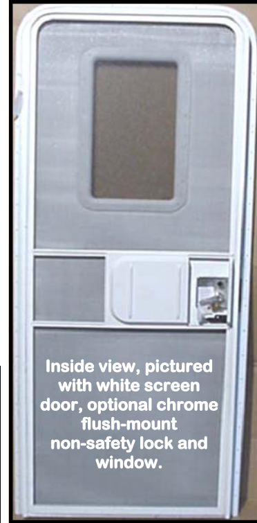
Inside view, pictured with white screen door, optional chrome flush-mount non-safety lock and window.

Contact us for pricing or see our website at www.randgsupply.com