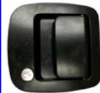
◀ Flush-Mount Safety Lock Installed (Black Only)