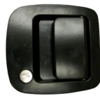
◀ Flush-Mount Safety Lock Installed (Black Only)