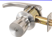
▲ Keyed Chrome Knob x Lever Lockset (for doors with no screen door only)