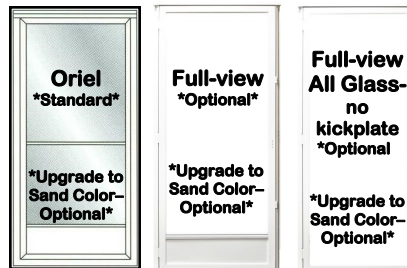
These are flush-mount storm doors (See page 13).