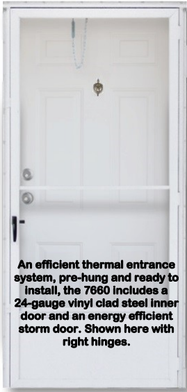
An efficient thermal entrance system, pre-hung and ready to install, the 7660 includes a 24-gauge vinyl clad steel inner door and an energy efficient storm door. Shown here with right hinges.