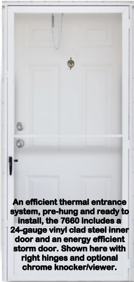
An efficient thermal entrance system, pre-hung and ready to install, the 7660 includes a 24-gauge vinyl clad steel inner door and an energy efficient storm door. Shown here with right hinges and optional chrome knocker/viewer.