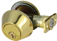
◀ Bright Brass Keyed Deadbolt