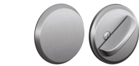
▲ Keyless Deadbolt Locksets w/Exterior Access Plate- Chrome Only