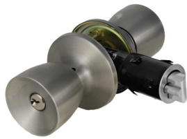
▲ Chrome Lockset