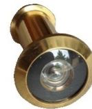
◀ Chrome or Bright Brass Viewer/ Peephole Only Installed