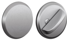
▲ Keyless Deadbolt Locksets w/Exterior Access Plate- Chrome Only