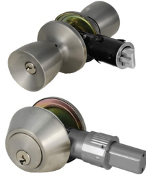
Keyed Chrome Deadbolt Lockset ▶

◀ Lockset and Deadbolt- Keyed-Alike- Chrome or Brass