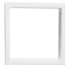
84095-10 ▶ Stationary Square Window for Exterior Door (10" X 10")

For locksets, see page 16. For sealants, screws and fasteners, see page 81.