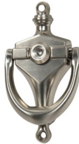
◀ Chrome Knocker/ Viewer Installed