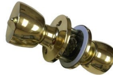
Bright Brass Lockset ▶