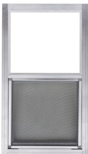
▲ 84097- Sliding Window for Exterior Door (14" x 27")