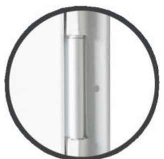
Four extruded hinges with bushings.