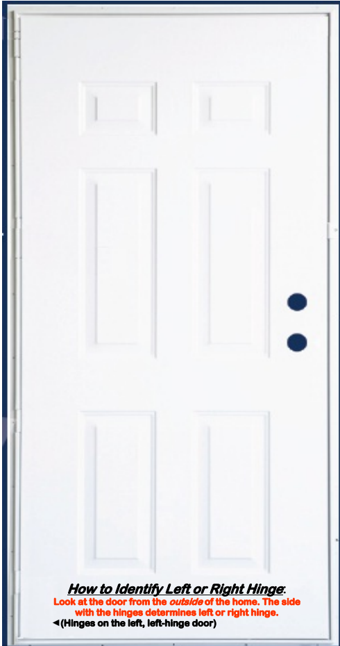
How to Identify Left or Right Hinge. Look at the door from the outside of the home. The side with the hinges determines left or right hinge. ◀(Hinges on the left, left-hinge door)

Sealant tape and screws are not included.