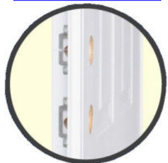
Fully prepped for knob/lockset and deadbolt lock.